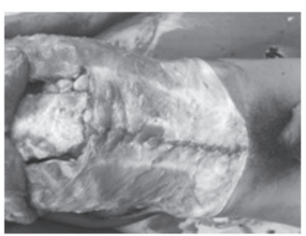
Figure 10 Figure 11 Figure 12

reflecting the anterior flap, care should be taken not to injure the rectus sheath as well as the neck structures. The whole of the anterior aspect of neck, chest and abdomen can be visualized and examined in this way.